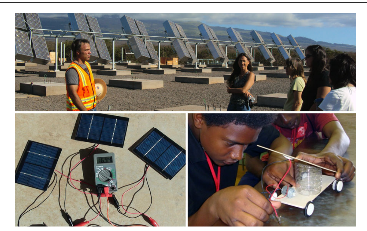
Fig. 2 ( Top ) Solar energy expert provides information about photovoltaic solar panels to TSI Energy teacher participants. ( Bottom left ) Solar panels and voltmeter from teacher supply kits in use during the